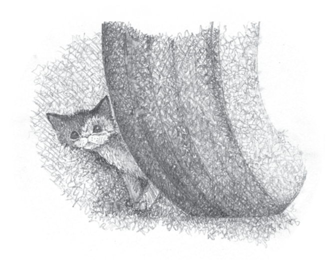
Holly Webb Illustrated by Sophy Williams